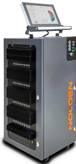
Fig.: NR7064 for 64 zones