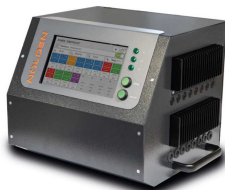
Fig.: NR8024-v2 for 24 zones