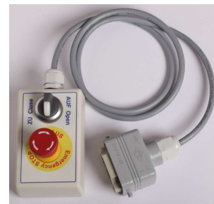
Fig.: Manual operation unit / Emergency-STOP