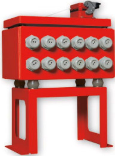
Fig.: Mould Connect "T" for thermocouples